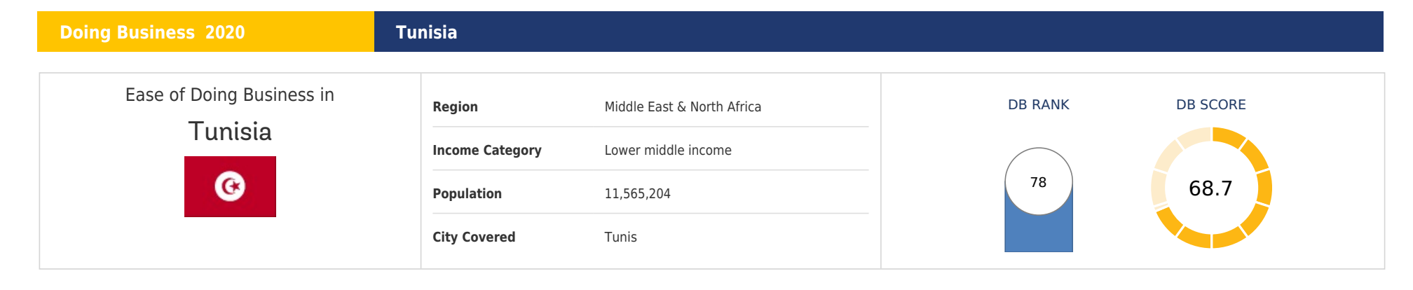
Rankings on Doing Business topics - Tunisia