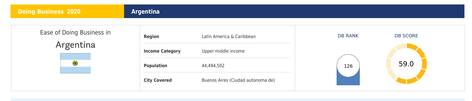
Rankings on Doing Business topics - Argentina